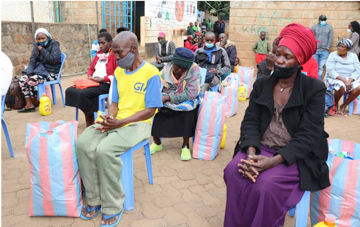
Food bank distribution with Spur families