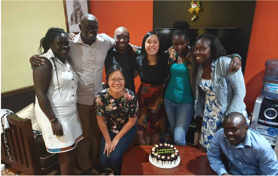
Celebrating 10 years of Spur Kenya