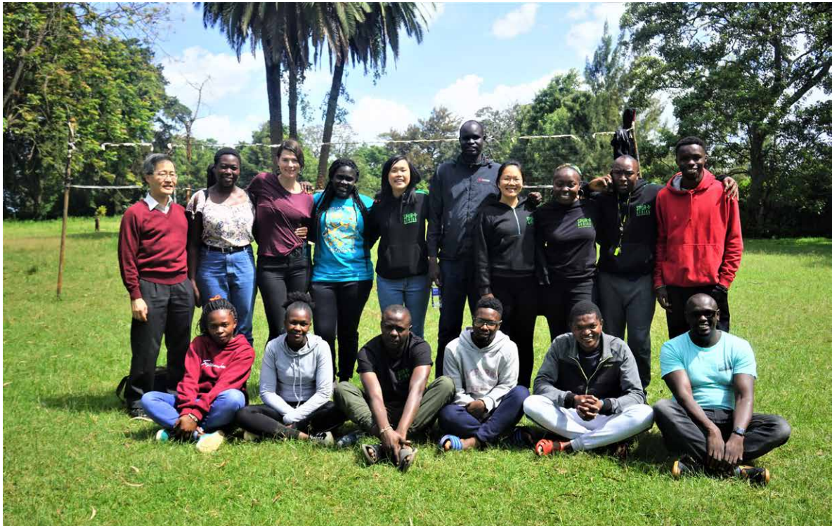
Spur workers and Mission team 2020 at Spur Camp