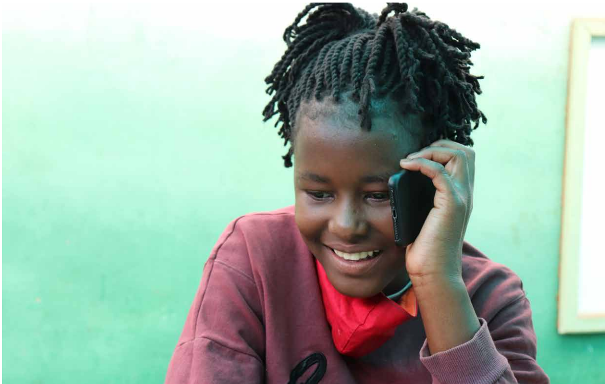
Phone calls to mentors