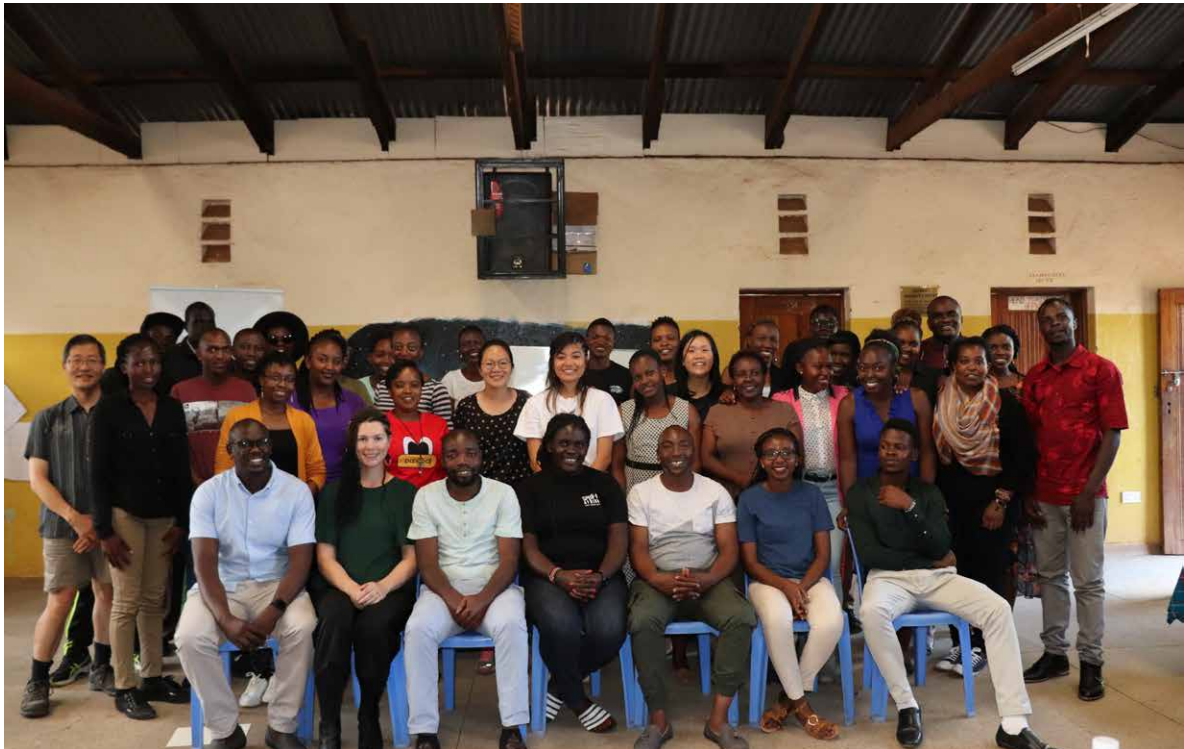
Mentorship Day January 2020