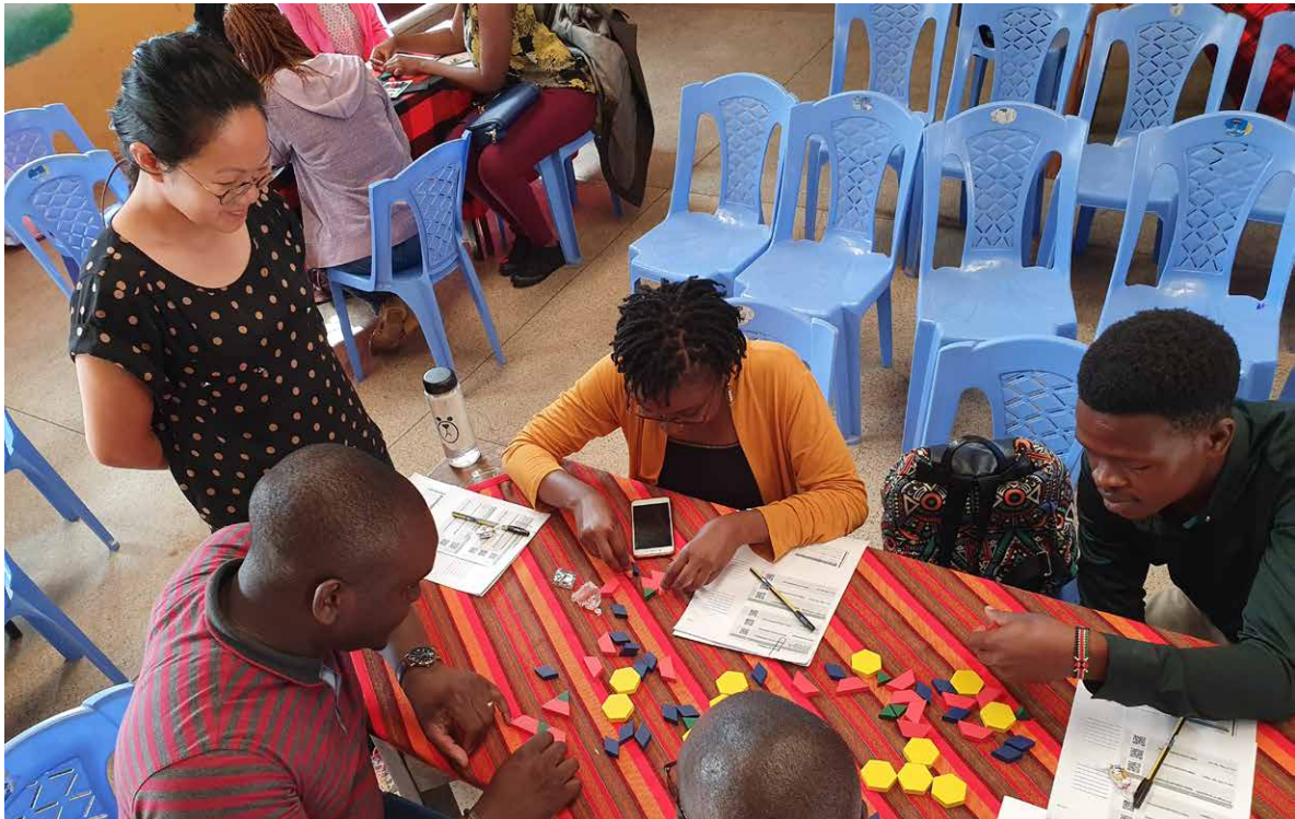
Maths activities at Mentorship Day