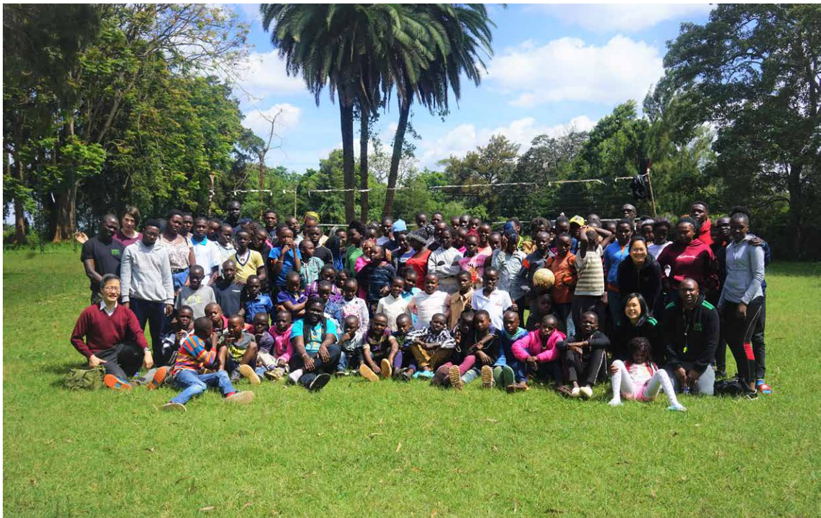
Spur children at January camp 2020