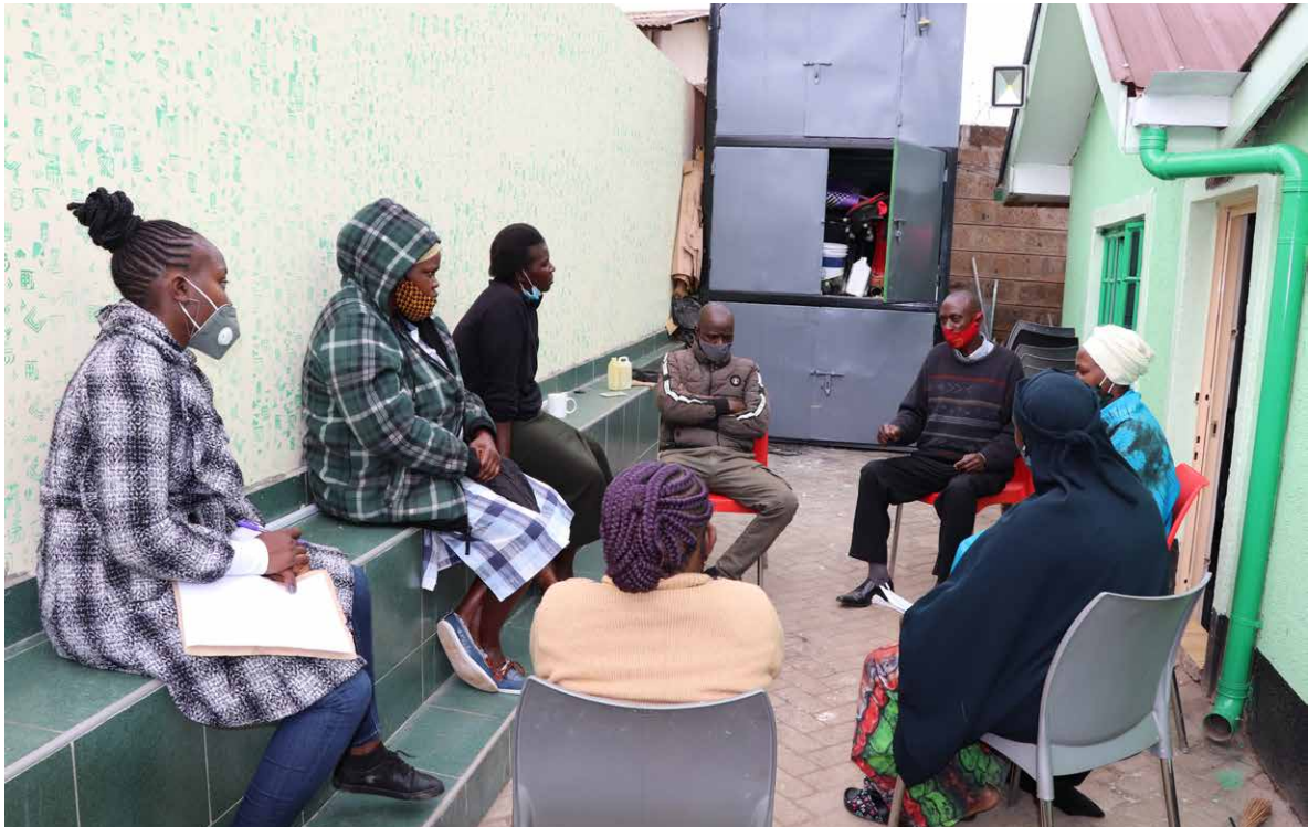
Parents meeting at the Spur centre