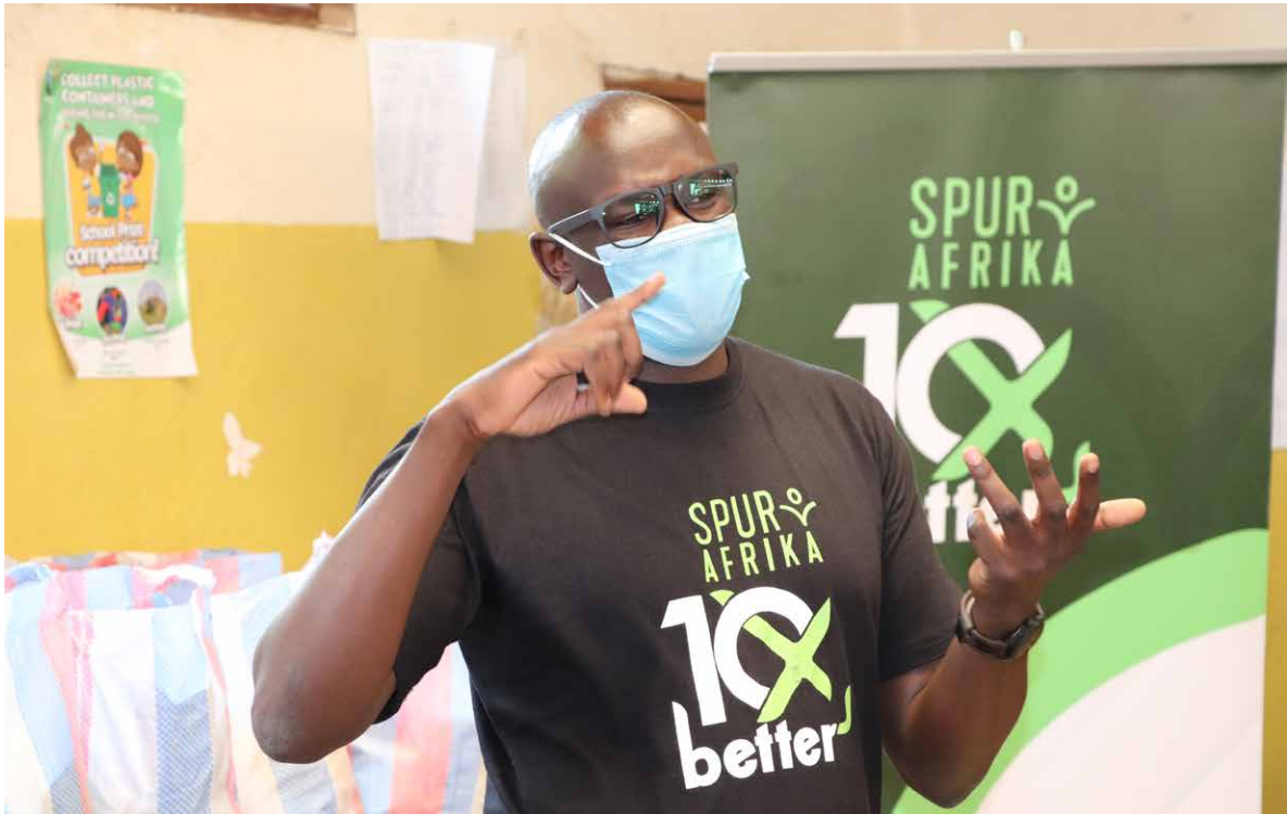
Patch wearing our special 10 years of Spur tee