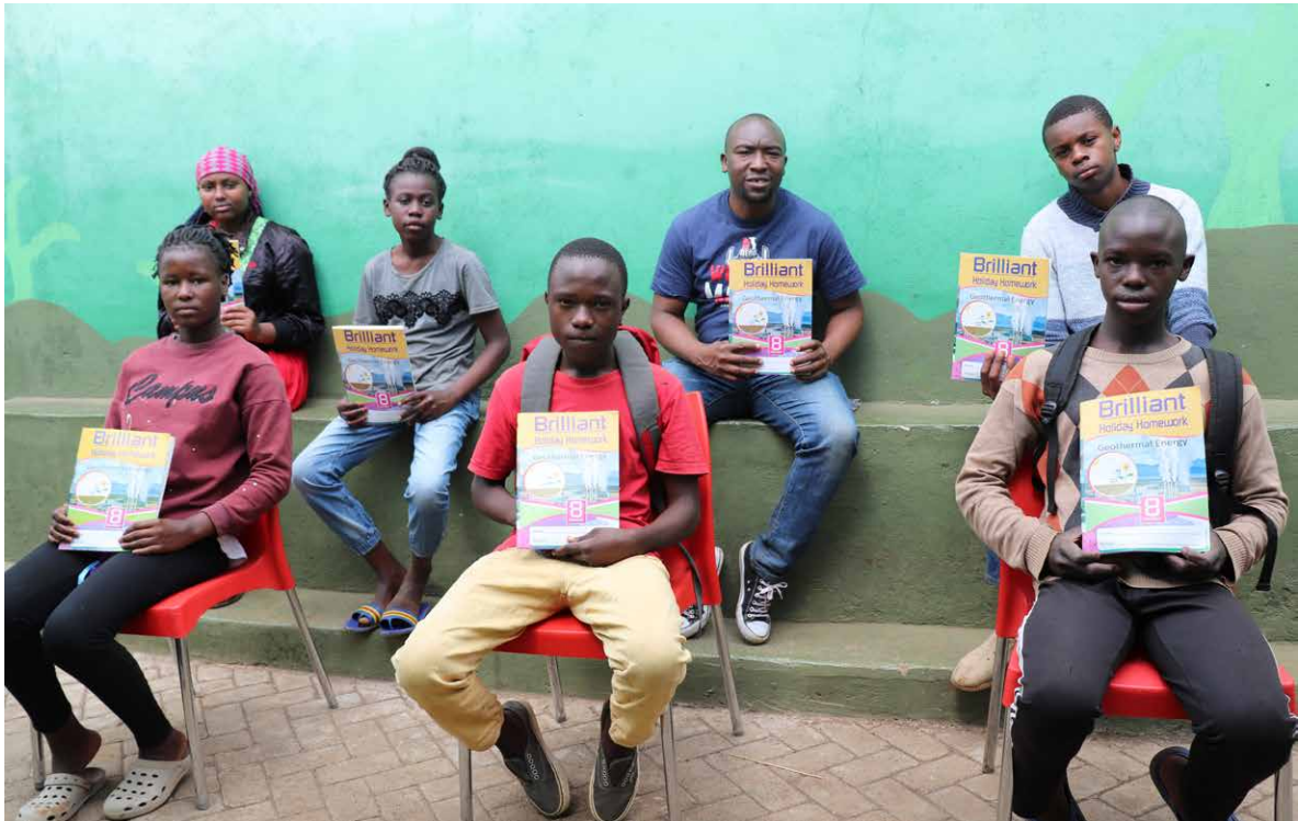
Learning at the Spur centre