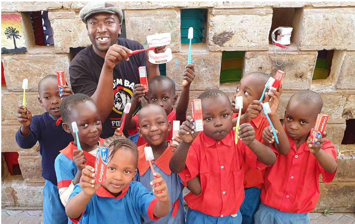
Oral Hygiene campaign 2020