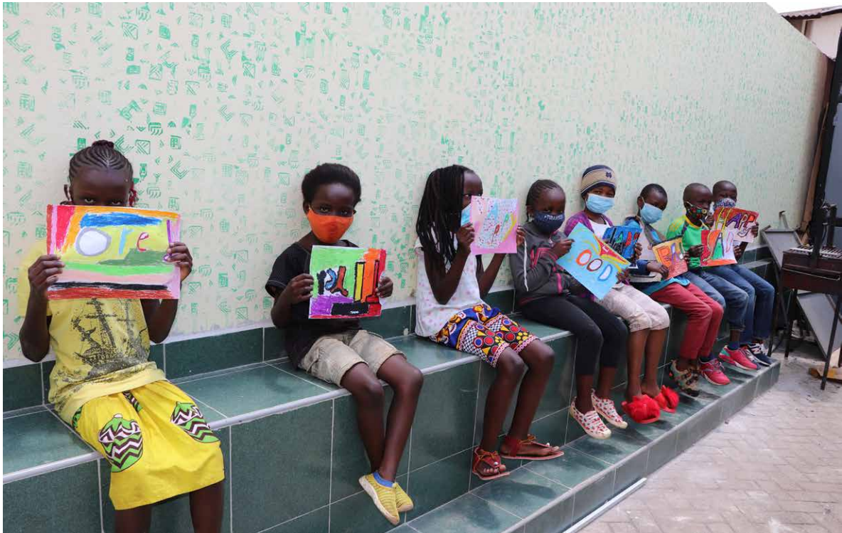
Art classes at Spur Centre