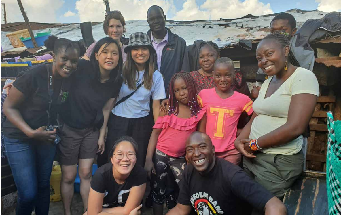
2020 January mission team on a home visit